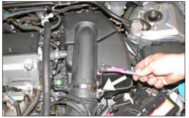
7. Loosen the stock hose clamp.