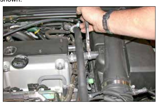
3. Using a pair of pliers, depress the hose clamp and slide it back off of the crank case vent on the air cleaner assembly as shown.