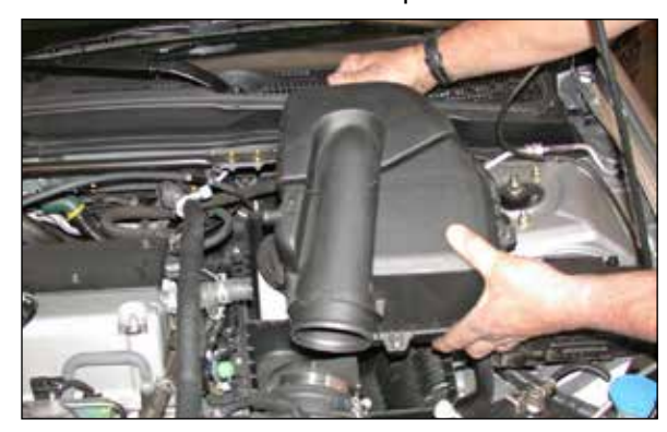
8. Loosen the 5 bolts and pull upwards to remove the upper air cleaner assembly as shown.