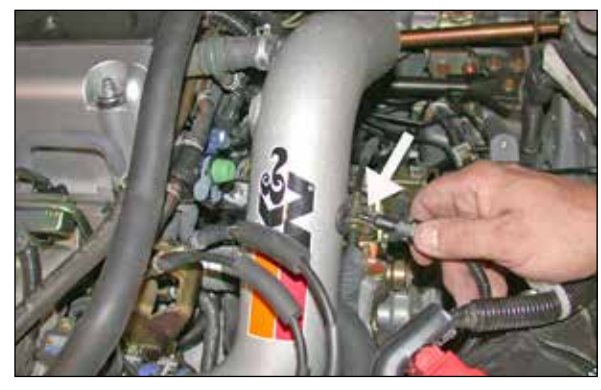
23. Push the air temperature sensor into the grommet on the K&N® intake tube as shown.