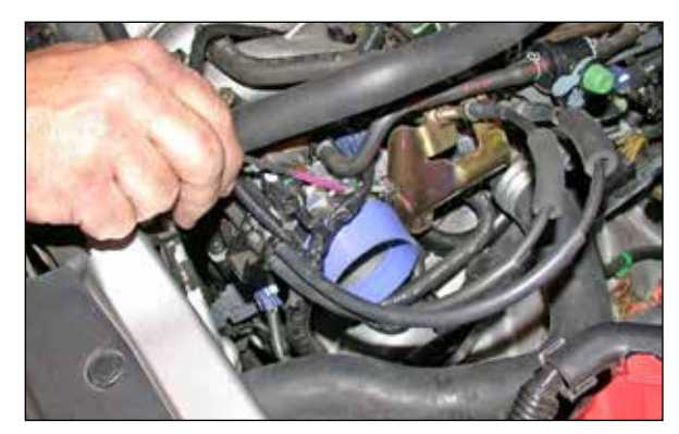
16. Install the silicone hose and hose clamp onto the throttle body as shown.

NOTE: It may be necessary to fully open the hose clamp so it will slide over the throttle body.