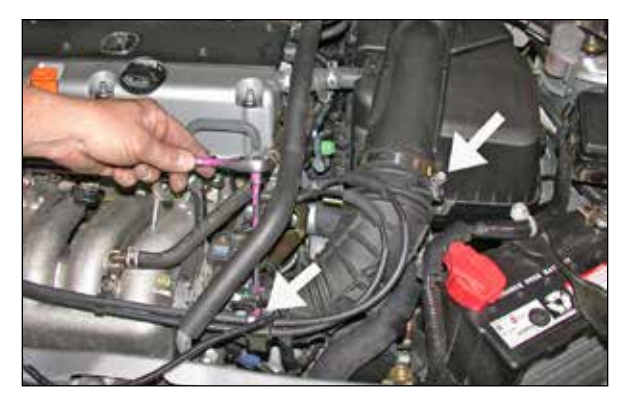
5. Loosen the two hose clamps at the throttle body and at the air cleaner assembly as shown.