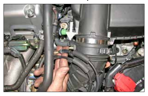
6. Remove the Idle air bypass control thermal valve vent hose from the vent on the stock intake tube as shown.