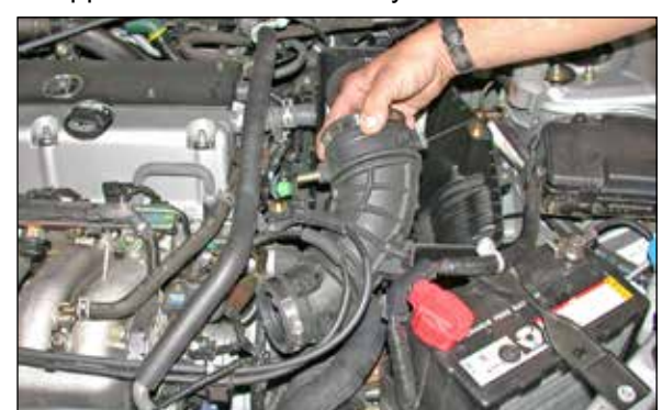
9. Pull the stock intake tube off of the throttle body, then remove the stock intake tube as shown.