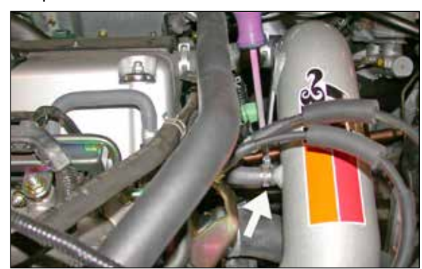
22. Reconnect the idle air bypass control thermal valve vent hose to the vent on the K&N<sup>®</sup> intake tube and secure with the provided hose clamp as shown.