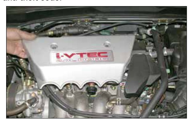
2. Loosen and remove the two bolts that secure the engine cover, then remove the engine cover as shown.

NOTE: Disconnecting the negative battery cable erases pre-programmed electronic memories. Write down all memory settings before disconnecting the negative battery cable. Some radios will require an anti-theft code to be entered after the battery is reconnected. The anti-theft code is typically supplied with your owner's manual. In the event your vehicles' anti-theft code cannot be recovered, contact an authorized dealership to obtain your vehicles anti-theft code.