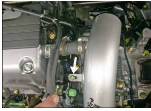
20. Using a 10mm socket secure the bracket to the air cleaner mounting point using the provided bardware.