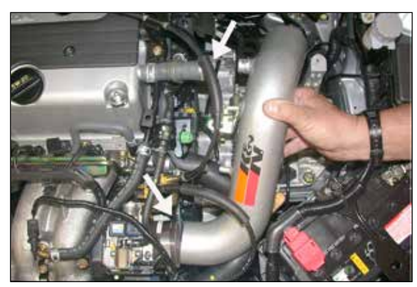
18. Install the second hose clamp onto the silicone hose, then, slide the K&N® intake tube into the silicone hose as shown. Line up the intake tube bracket with the original air cleaner mounting point.