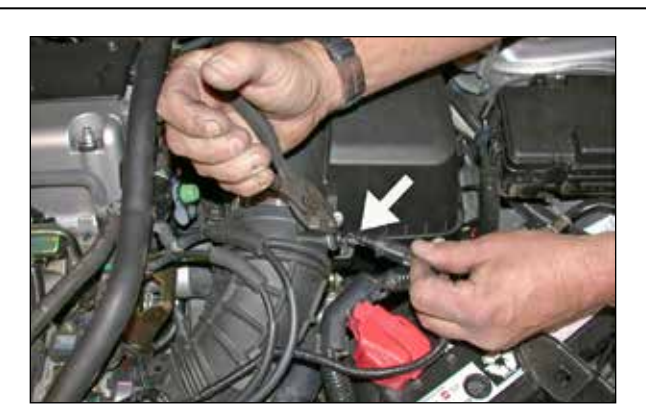
4. Using a pair of pliers, depress the hose clamp and remove the air temperature sensor from the stock intake tube as shown.