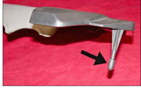
25. Install the rubber cap plug onto the stand off on the engine cover as shown.

NOTE: Drycharger® air filter wrap; part # RX-4730DK is available to purchase separately. To learn more about Drycharger® filter wraps or look up color availability please visit http://www.knfilters.com®.