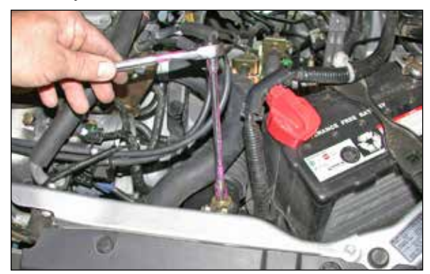
12. Using a 10mm socket, loosen the bolt that secures the air inlet duct as shown.