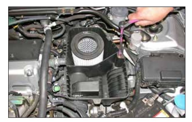
10. Loosen and remove the two bolts and one nut on the lower air cleaner assembly as shown.