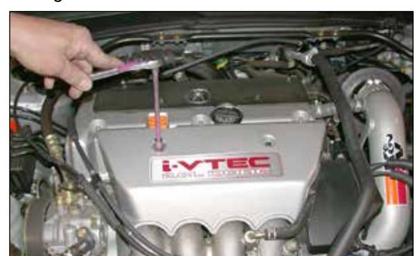
26. Reinstall the engine cover as shown.