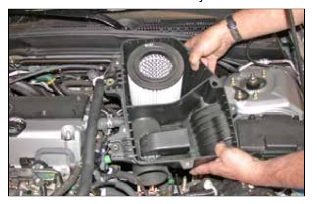
11. Pull upwards to remove the lower air cleaner assembly as shown.