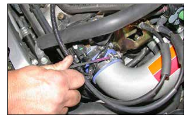
21. Using a flat blade screwdriver, tighten the hose clamp on the silicone hose as shown.