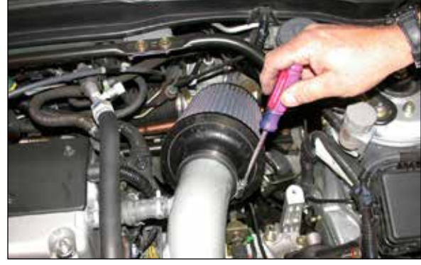
24. Install the K&N® air filter onto the K&N® intake tube and secure with the provided hose clamp as

NOTE: Drycharger® air filter wrap; part # RX-4730DK is available to purchase separately. To learn more about Drycharger® filter wraps or look up color availability please visit http://www.knfilters.com®.