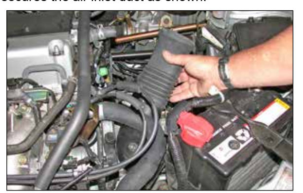
13. Remove the air inlet duct as shown. NOTE: K&N Engineering, Inc., recommends that customers do not discard factory air intake.