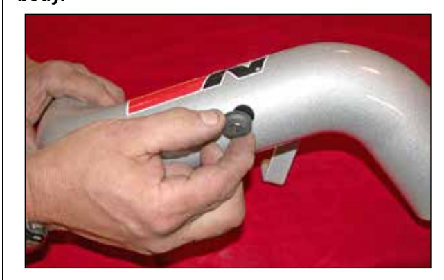
17. Install the provided grommet into the hole on the K&N® intake tube as shown.

NOTE: It may be necessary to fully open the hose clamp so it will slide over the throttle body.